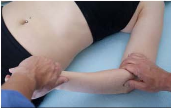
Figure 1. Hand placement for treatment of Annular Ligament.