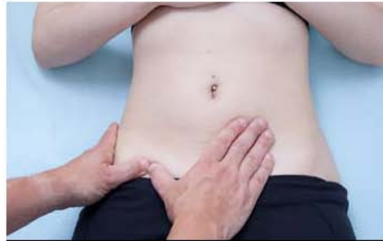
Figure 3. Hand placement for treatment of ASIS attachment for Inguinal Ligament.