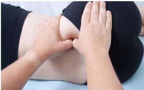
Figure 2. Sidelying position for treatment of Iliolumbar ligament.